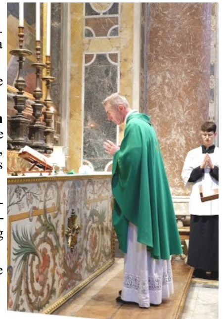
MASS IN ST PETER'S BASILICA

Further details and a presentation to follow to see what interest there might be.