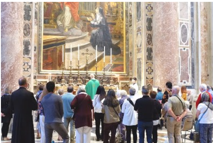
Church of San Salvatore in Onda, Rome, with St Vincent Pallotti under the altar